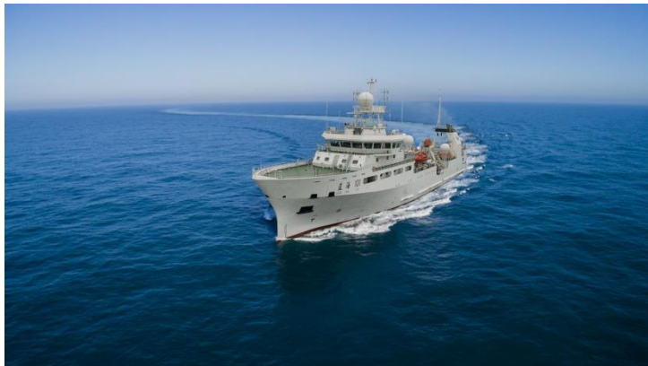
Figure 1 Research vessel "Lanhai 101"

The research vessels' names were Lanhai 101 and Lanhai 201 (Figure 1). These two vessel parameters are the same. The total length of the vessel is 84.50 meters, with a total tonnage of 2883 tons, a range of 10000 nautical miles, self-sustaining capacity of 60 days, wind resistance of 12 levels, economic speed of 12 knots, maximum speed of 15 knots, and a total capacity of 60 people . The main engine power is 2720 kilowatts. Each vessel has three types of operations: pelagic trawl, squid jigging fishing, and longline fishing.